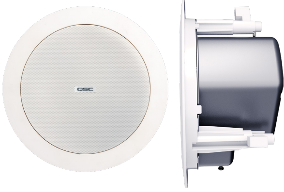
Q-SYS NL Series NL-C4

Full-range network ceiling loudspeaker for Q-SYS