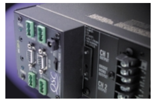
Save space and weight by plugging the DSP-3 into the back of most DataPort-equipped QSC amplifiers. Or use multiple DSP-3s as a stand-alone, rack-mountable DSP solution.