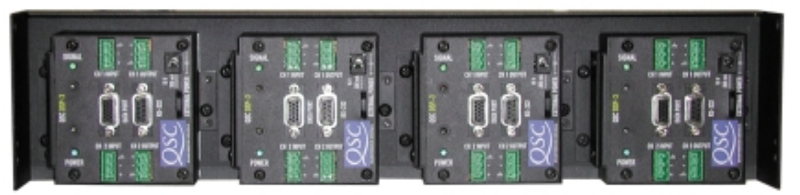
A Remote Rack Mounting Bracket is available for PowerLight, 4-channel QSC amplifiers, or for non-DataPortequipped amplifiers. Designed to be bolted to the rear of an amplifier rack, up to four modules can be mounted to each panel, providing up to eight channels of DSP processing in a three rack-unit space.