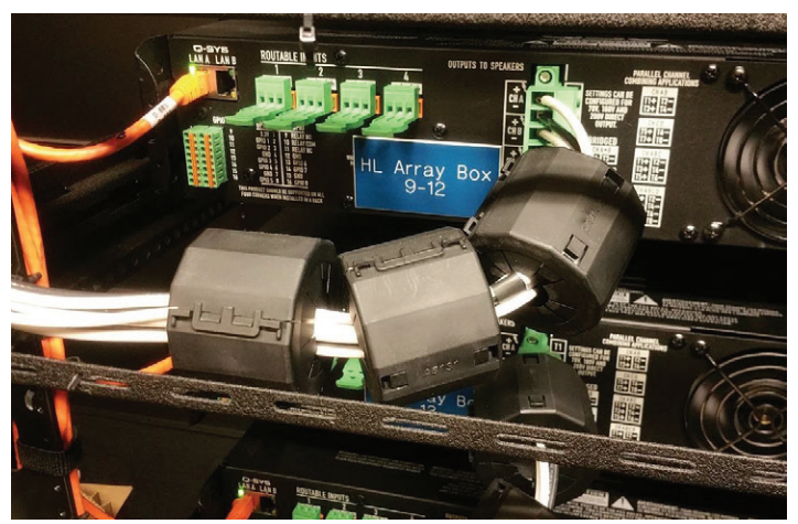
Figure 2. Ferrite chokes help decouple cross-coupled switching noise away from amplifier outputs.

If it is not feasible to replace the cabling with an equivalent quantity of twisted pairs, then it may be necessary to add one or more ferrite chokes (with clamp-on cores) over the wires near where they connect to the amplifier outputs. The ferrite chokes add an inductive reactance to the loudspeaker lines that helps decouple the high-frequency energy of the switching noise transients from the