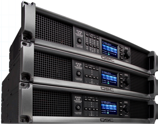
CXD SERIES FOR INSTALLED APPLICATIONS