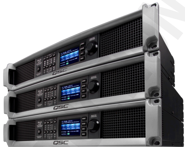
PLD SERIES FOR PORTABLE/PRODUCTION APPLICATIONS

Introducing two new product lines that will forever change the way you think about power amplifiers. Powerful, flexible, highly efficient, and easy to operate, the PLD and CXD Series Processing Amplifiers offer an incredible combination of advanced technology, legendary QSC reliability, and of course, unparalleled sound quality. Visit us online at QSC.com for a complete product tour.