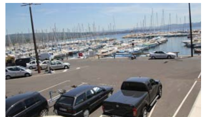
The Sea Facing Parking