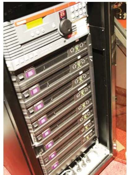
The projection booth equipped with Christie Digital Projector, GDC Server, GDC IMB, Dolby Digital Processor and QSC Audio System