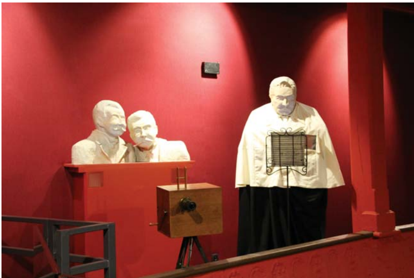
Statues of Lumière Brothers inside the auditorium