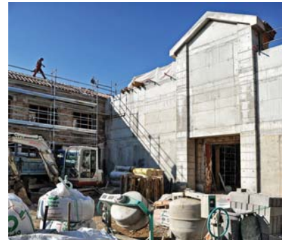
During the Renovation

More than a century on, the historic theatre has not only been refurbished to make a new beginning but has also restored the glory of some of the golden years of cinema. The dusty chairs have been replaced by velvet seats, and the grubby carpets by polished oak and black marble floors. The impressive