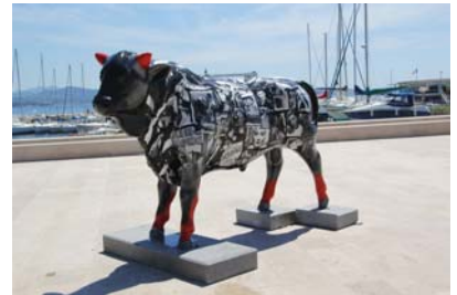
Look close, the cow has a filmi theme

The theatre fans see it as a French heritage and feel it should be a part of a larger cultural project that offers educational tours for school children, screens restored films and hosts film festivals.