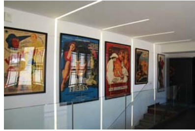
The Cinema Lobby